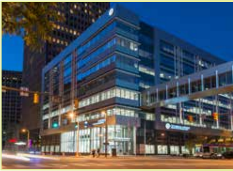
The New Cuyahoga County Administrative Headquarters at 2079 East Ninth Street and Prospect Avenue.