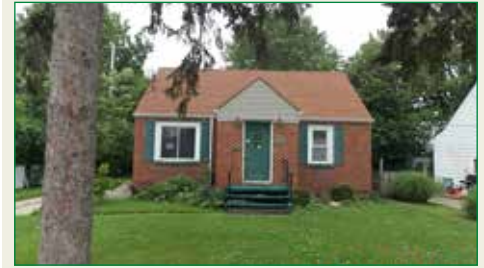
Advantage Plus Loan Program 19211 Pasnow Ave (641-11-151) Euclid