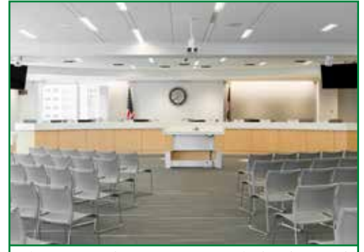
The New Cuyahoga County Council Chambers inside the Cuyahoga County Administrative Headquarters

Demolition began April 9, 2013, and the building was completed in July 2014.