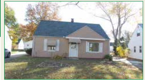
Advantage Plus Loan Program 23330 Roger Drive (644-21-009) Euclid

The Land Bank places properties in the Advantage Plus Loan Program for a select period of time, during which interested, qualified buyers can place offers. The strongest offers will be selected. To view loan requirements and properties currently available for the Advantage Plus Loan Program, interested buyers can visit http://www.cuyahogalandbank.org/advantageplus .