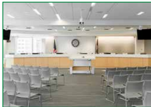
The New Cuyahoga County Council Chambers inside the Cuyahoga County Administrative Headquarters

Demolition officially began on April 9, 2013 and completion of the new building is expected in July 2014. We are looking forward to moving into Cuyahoga County's new headquarters.