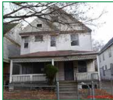
1163 Addison Rd (105-25-009)